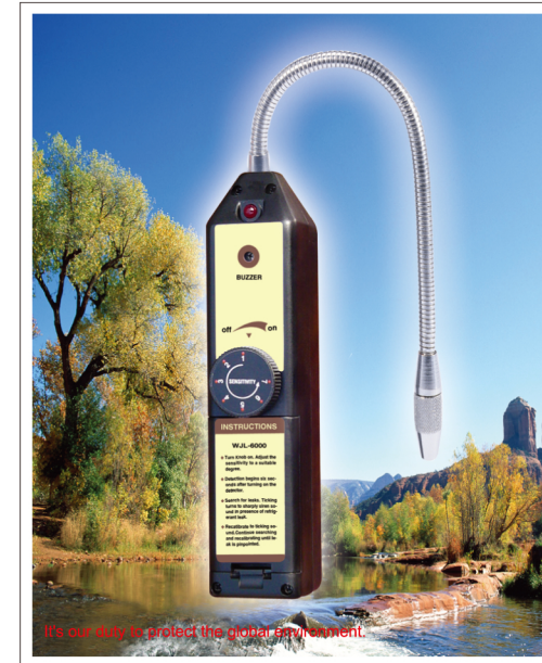
WJL-6000 HALOGEN LEAK DETECTOR